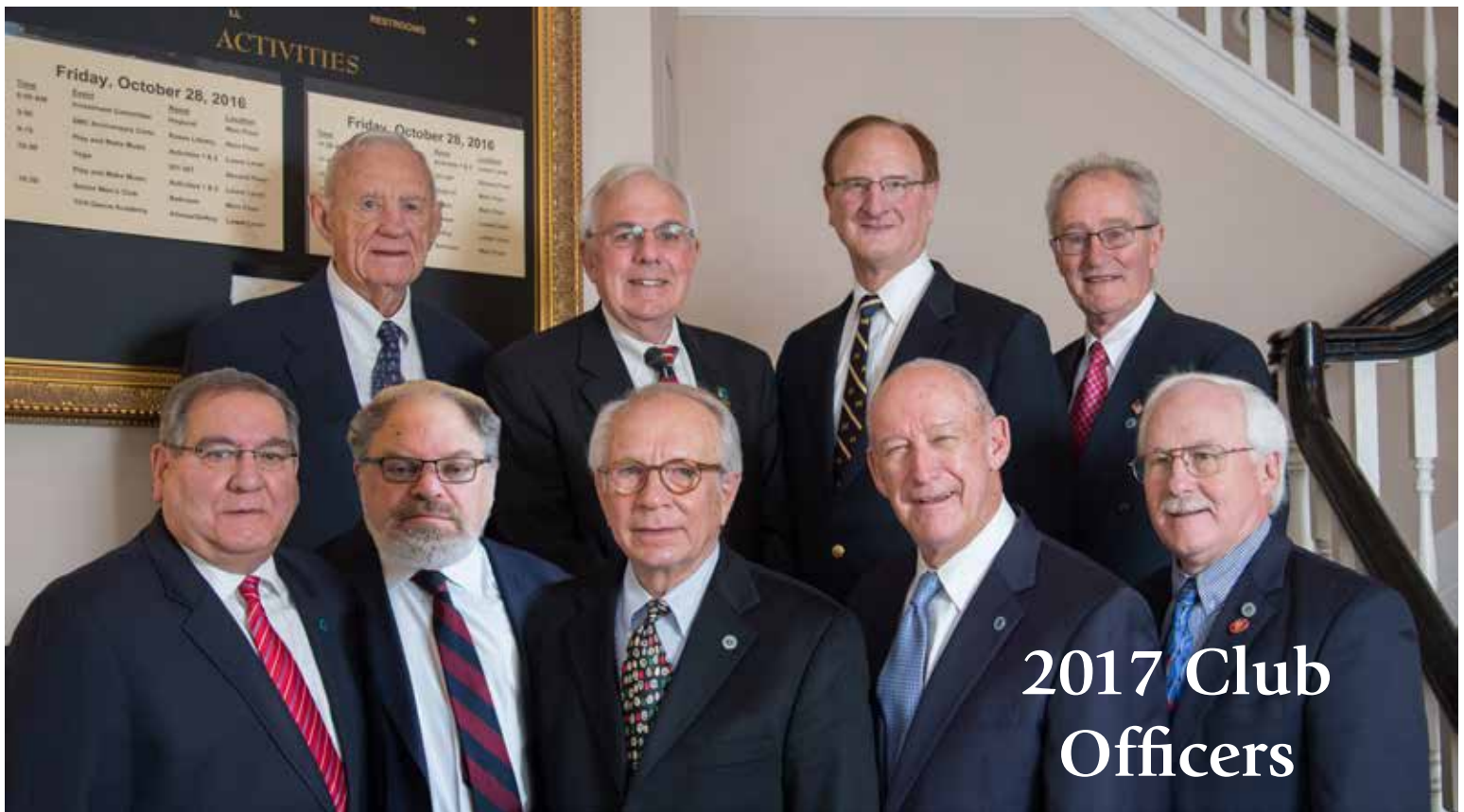
2017 Club Officers