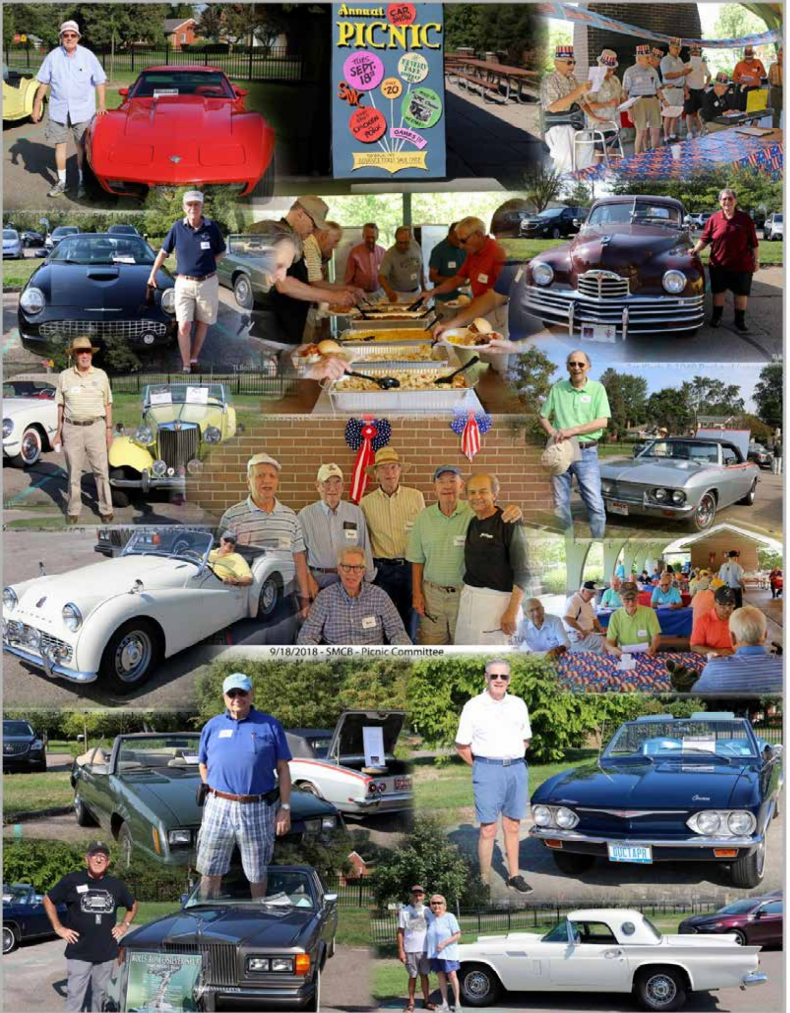
9/18/2018 - SMCB - Picnic Committee