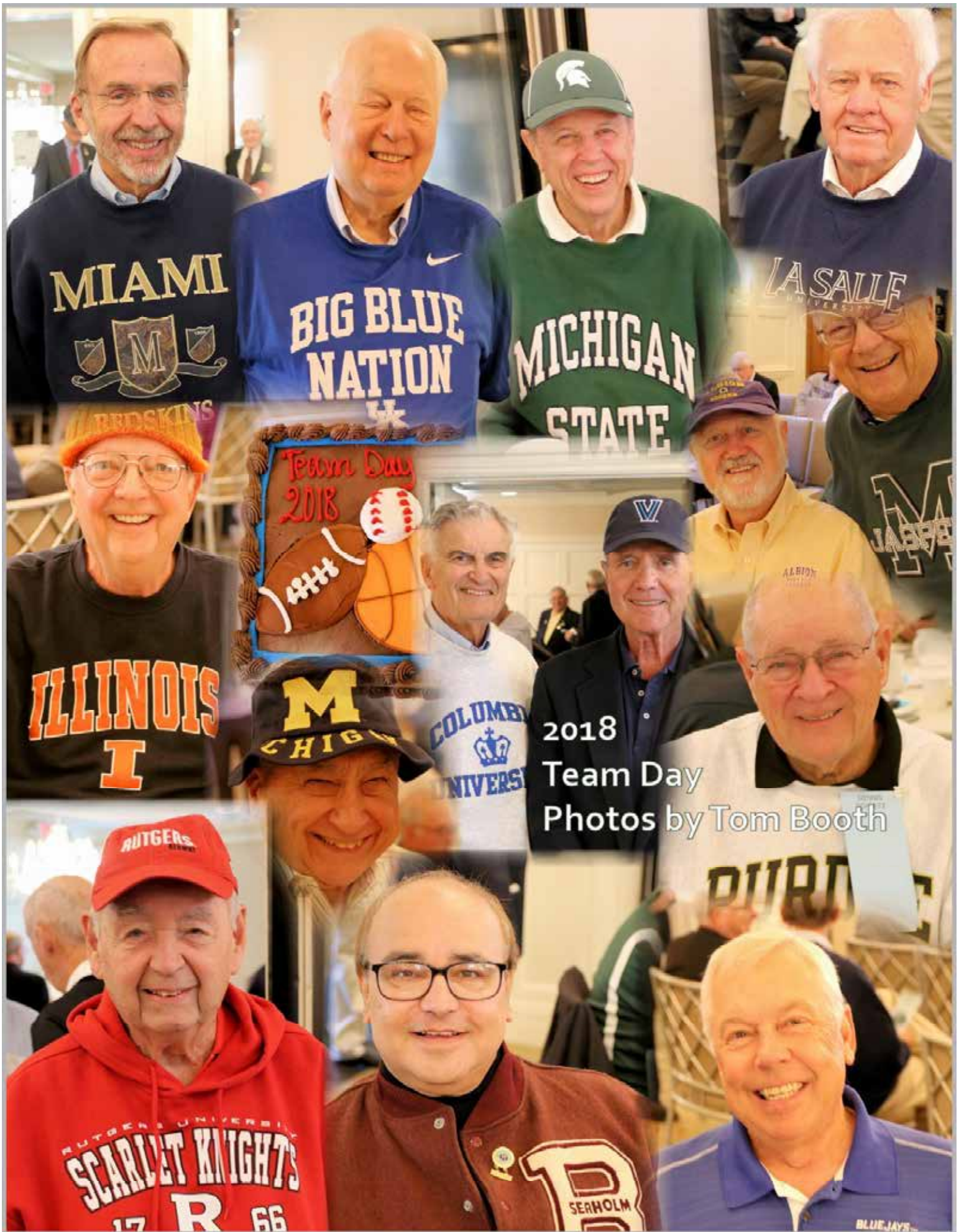
2018 Team Day Photos by Tom Booth